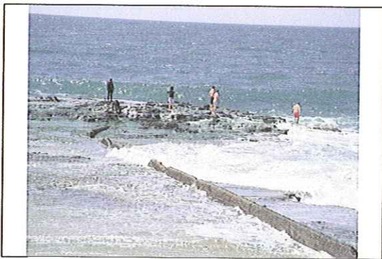
Above: Rock Hop at Woonona Point

Overall we had 100 people sign the attendance sheets.